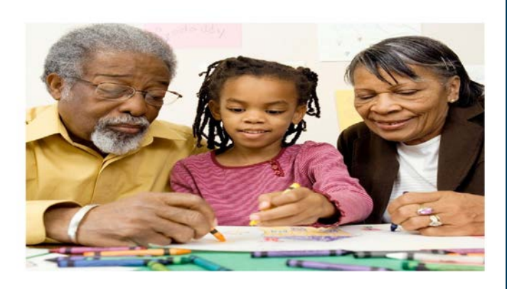
Location: Access Mental Health Agency 1903 Phoenix Blvd. Suite 200 Atlanta, GA 30349

Thursdays 10am-12 pm June 22, 2023- August 10, 2023 Registration: <a href="https://bit.ly/PASTA0623">https://bit.ly/PASTA0623</a>